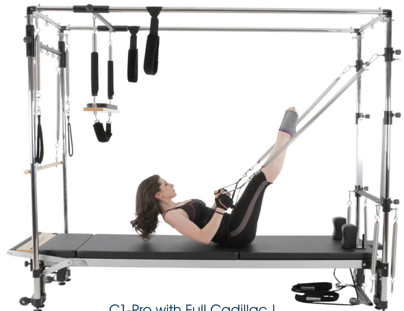
C1-Pro with Full Cadillac !

For those seeking a last minute bargain we still have a limited amount of C1R remaining at £1299.99 www.mad-hq.com/product/align-pilates/c1r-reformer . Please note all C1 accessories are compatible with any C1* machine and all C1 machines have backward compatibility for spare parts, which offer the same great value as the machines themselves! Alternatively January sees the launch of the new H1 Reformer at £999.99 including VAT, see www.mad-hq.com/product/h1-home-reformer for details.